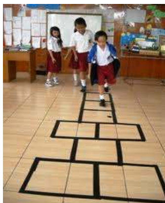
Figure 2 Elementary students were playing engklek